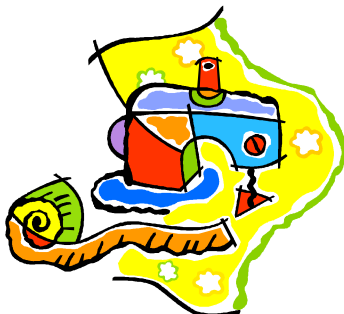
Mary's Quilt Shop where "fun people gather."