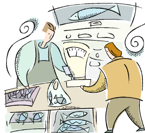
Pike Street Fish Market where the "Fish Philosophy" began

hotel from where, in the early afternoon, our motor coach will pick us up and transport our group to the beautiful ms Westerdam for the next leg of our fabulous adventure.