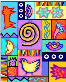
La Conner Quilt & Textile Museum

*Your friends & family are welcome to join us*